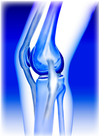
X-Ray of Human Knee

Healthy kidneys get rid of excess phosphorus in the urine. In kidney disease, phosphorus builds up in the blood causing itching, muscle aches and pains, bones that break easily, calcification (calcium deposits) of the heart, skin, joints, and blood vessels. In order to avoid these problems, it is important to limit phosphorus consumption and take the phosphorus binders with meals and snacks.